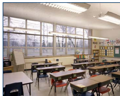
Figure 3. Daylighting copyroom at Richmond Elementary School. Notice the warm, even distribution of light on the ceiling and reduced glare on the desks. The room is evenly lit, with little stark contrast to distract the eyes. Lighting power density: 0.81 W/sf.