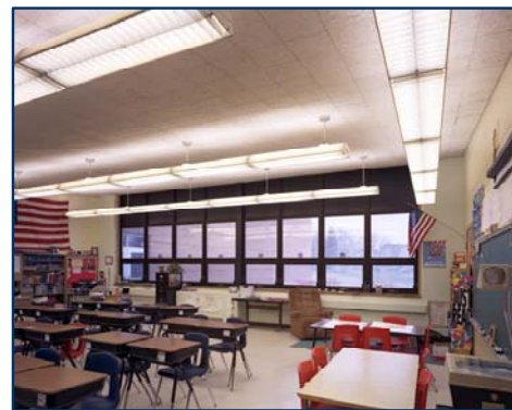
Figure 2. Original window renovation at Richmond Elementary School. The high contrast between the dark brown frames and the outside light is less than ideal. Glare is still evident on the two tables near the blackboard. Lighting power density: 1.53 W/sf.