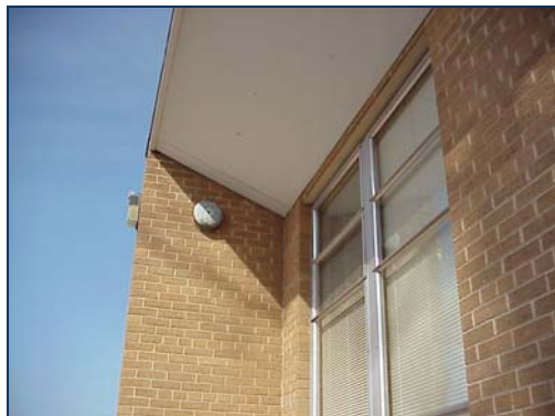
Richmond Elementary School windows.

The school district replaced old fixtures, installed new high reflective ceilings, used high-reflection paints, replaced windows, and installed controls to sense room light levels. The classrooms incorporate two types of windows—clerestory and view windows. Clerestory windows are narrow windows located adjacent to the ceiling; they are the primary source of room light. View windows are larger windows located directly below the clerestory. The view windows have perforated roller screens or intra-glass blinds to reduce incoming light during the brightest part of the day—although the blinds are rarely needed.