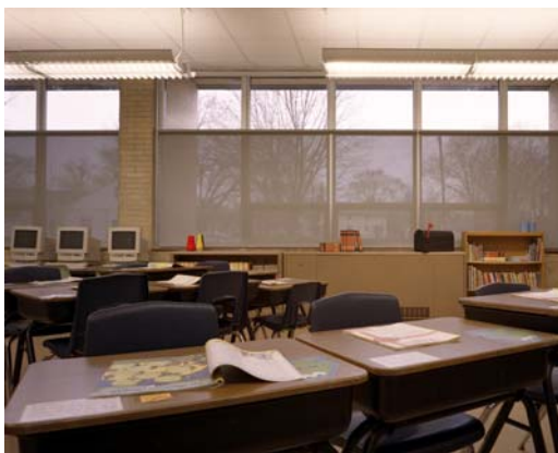
Foster Elementary classroom showing window screens.

“The biggest benefit of the copyrooms is that owners can test daylighting,” says Daylighting Program Manager Abby Vogen. “People can become familiar with the new light fixtures and the lower light transmittance of the windows. Once people experience the space they understand the lighting benefits of daylighting.” Another benefit: According to studies by the Herschong-Mahone group, daylighting can also increase student test scores.