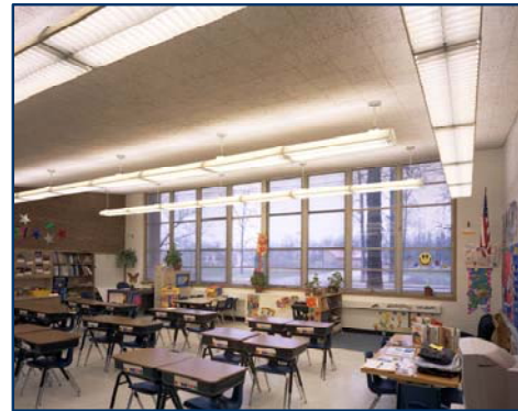
Figure 1. Original windows and lights at Richmond Elementary School in Appleton, Wisconsin. Notice the unfiltered daylight that produces glare on the desks, and the uneven light on the ceiling from the poorly diffused fluorescent fixtures. Lighting power density: 1.53 W/sf.

The Daylighting Collaborative suggested the solution shown in Figure 3—glare-reducing, low-glass; a smaller, energy-efficient lighting system with daylighting sensors; and wall treatments to increase the reflectance of the room near the ceiling. Schultz was assigned to the copyroom and enjoys teaching in the new classroom. “With the new windows, I rarely use the shades,” she says. “I like the strong connection to the outside, without all the distractions, and the lights are not harsh.”